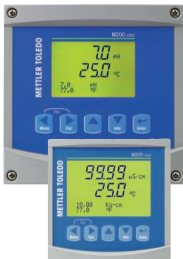
M200 easy 1/4 DIN

When expectations for a field device go beyond just good measurement, the M200 easy is convincing with its exceptional user-friendliness. It accepts all digital easySense sensors without the need for calibration or configuration. For commissioning, a user-friendly “Quick Setup” routine will guide you through the first settings.