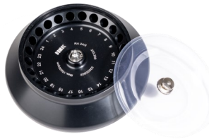
RA 24/2 - Order ref. No.: 437480