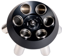
RA 6/50 - Order ref. No.: 438545