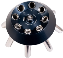
RA 8/15 - Order ref. No.: 438526