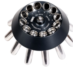
RA 12/12 - Order ref. No.: 447993