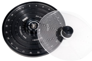
RH 24 - Order ref. No.: 449568