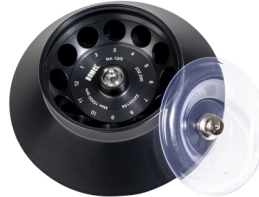
RA 12/5 - Order ref. No.: 449201