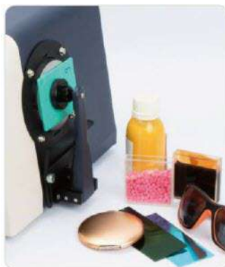
Liquid, Powder, Solid Sample Measurement

Transmittance Measurement: Adopt D/0° Geometry, conform to ISO, CIE, ASTM and DIN standard.